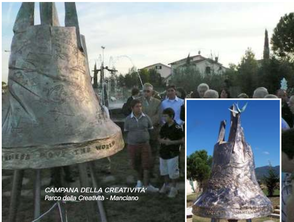
CAMPANA DELLA CREATIVITA' Parco della Creatività - Manciano