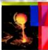
Travel through melting bronze (With Georgia University)