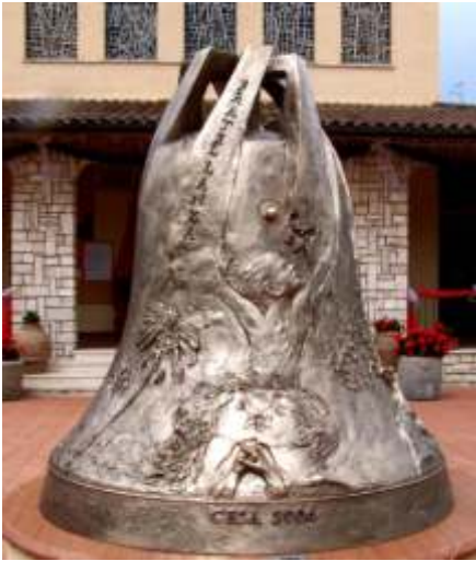
CAMPANA DELLA FRATELLANZA Chiesa dei Santi Michele Arcangelo e Lucia - Cesa Inaugurata il 20 Agosto 2006