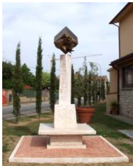
ATTIMI DI PARADISO Chiesa dei Santi Michele Arcangelo e Lucia - Cesa Marciano della Chiana - Arezzo