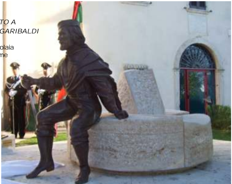
MONUMENTO A GIUSEPPE GARIBALDI Terme Antica Querciolaia Rapolano Terme