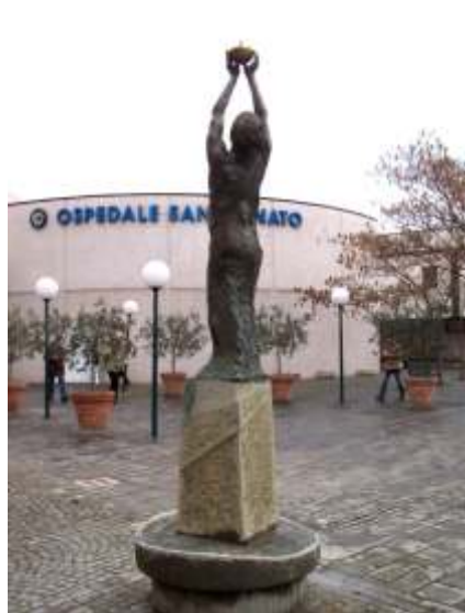
MONUMENTO A SAN DONATO Ospedale di Arezzo