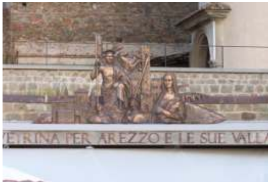
OMAGGIO ALLA NOSTRA STORIA Emiciclo Giovanni Paolo II Scale mobili di Arezzo