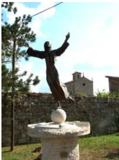
MONUMENTO A SANTA CATERINA DA SIENA Università degli Studi di Siena Centro Universitario di Pontignano Castelnuovo Berardenga - Siena