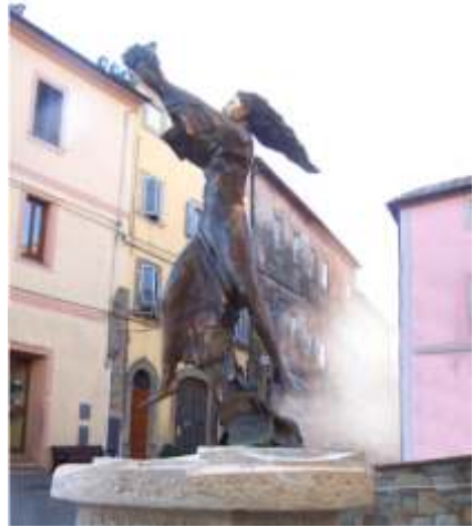
MONUMENTO A DINA FERRI Radicondoli - Siena