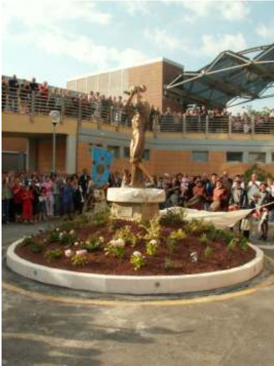
SANTA MARGHERITA DA CORTONA Nuovo Ospedale della Valdichiana Cortona (AR)