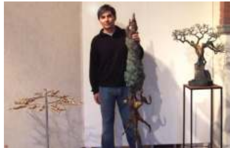
SOLIDARIETÀ - TOSCANI - IN MEMORY OF MARCO POLO IN CHINA